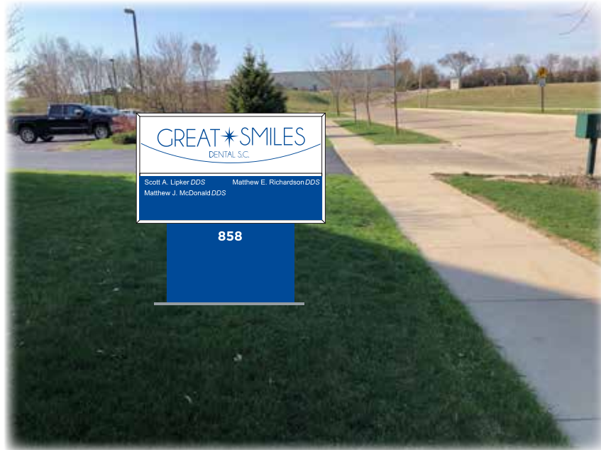
New Sign in Place